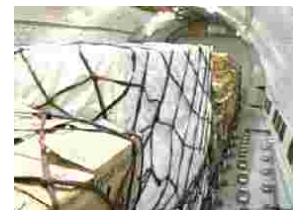
Breathable, reduces product damage and condensation

for more information and a sample please send an email to jpemond@blueyellc.com