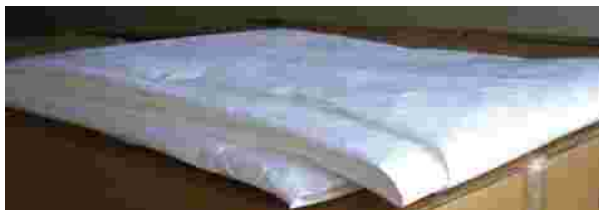
Extremely compact and light weight, weighing only 2 kg

The graph shows the load temperature of common shipment covers compared to the Blueye Blanket when exposed to the sun on tarmac