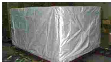
Quick and easy to apply, only takes 7-8 minutes with 2 people